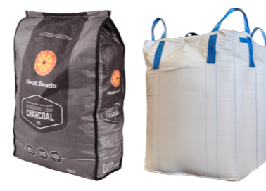
WPP & FIBC