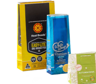
SOS (Self Opening Satchel)