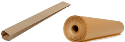
Can End Bags & Snake Wrap