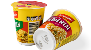
Cups & Bowls