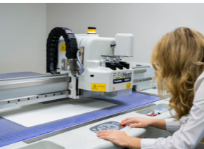
Capabilities: Hot melt glue, handles, embellishments, graphic design, lamination, different print types, specialised RecycleMe™ coating.