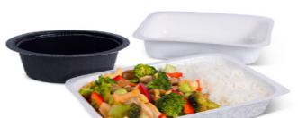
Ovenable board and paper for airlines, convenience stores etc