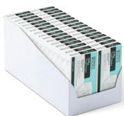
SHELF READY PACKAGING