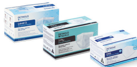
PHARMACEUTICAL, HEALTH & BEAUTY