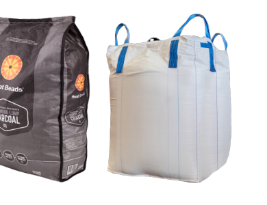
WPP & FIBC