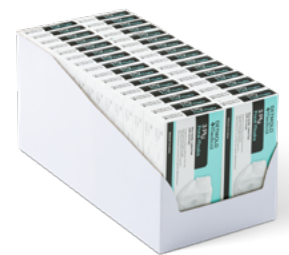
SHELF READY PACKAGING