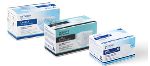
PHARMACEUTICAL, HEALTH & BEAUTY