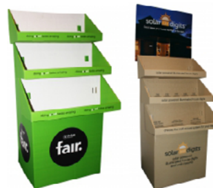
POINT OF SALE