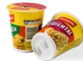
Cups & Bowls