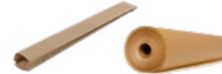
Can End Bags & Snake Wrap