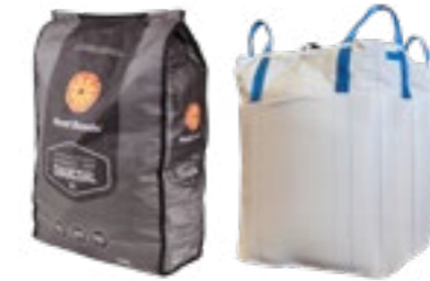
WPP & FIBC