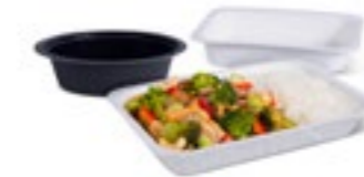
Ovenable board and paper for airlines, convenience stores etc