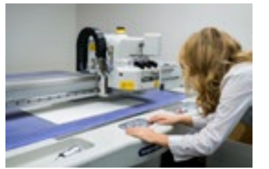
Capabilities: Hot melt glue, handles, embellishments, graphic design, lamination, different print types, specialised RecycleMe™ mineralised coating.