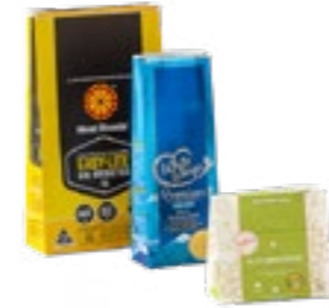
SOS (Self Opening Satchel)